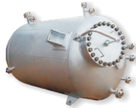
HP Autoclave (25 bar)