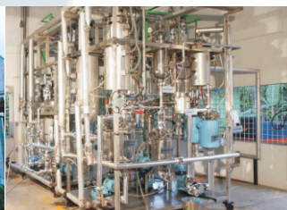
Pilot Plant at (MHRDC)