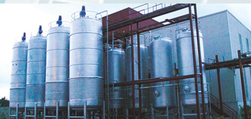
Lecithin Tank Farm