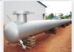
Splitting Column (60 bar)