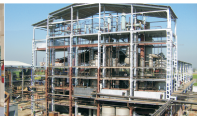
Edible Oil Refining Plant