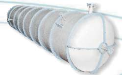
Distillation Column (Low Temp.)